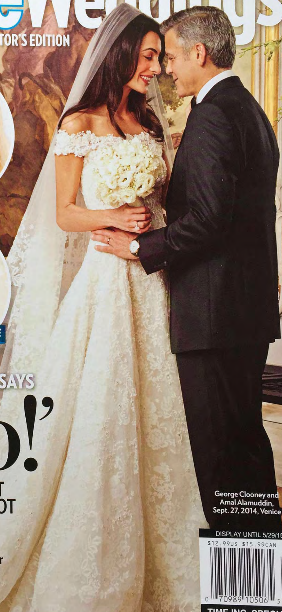
George Clooney and Amal Alamuddin, Sept. 27, 2014, Venice